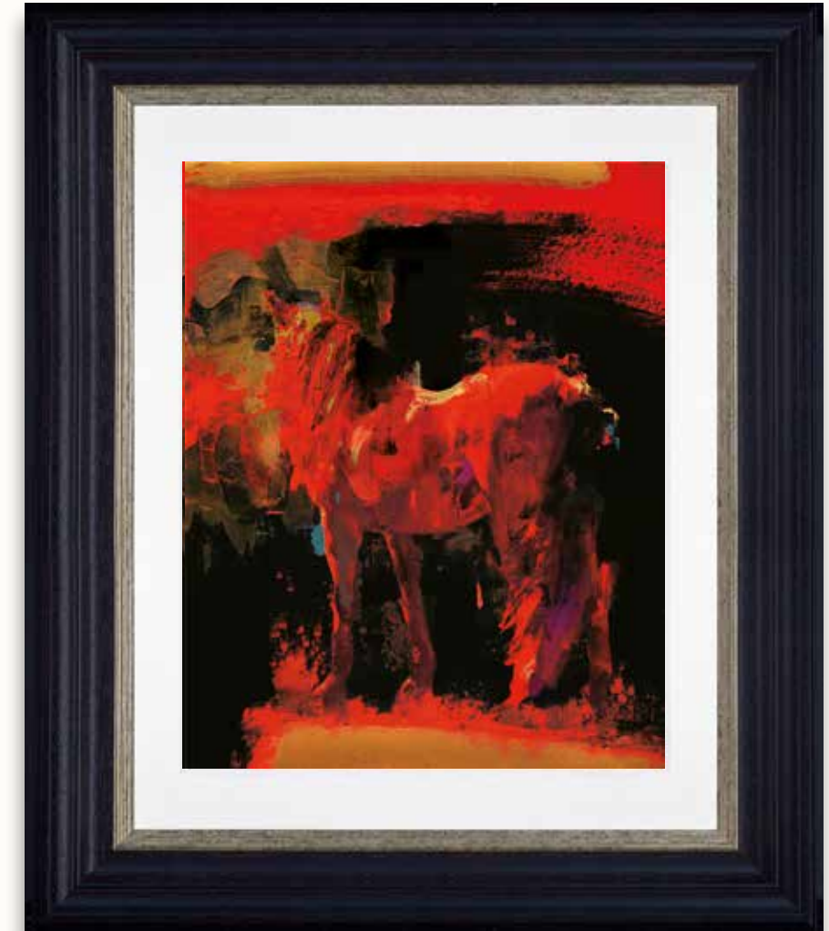
Newton Series II Red B